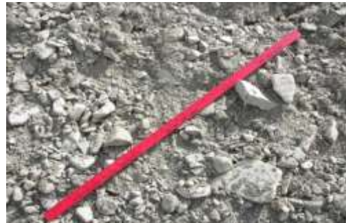
6BL: 6" Minus Tailings Blend. Combining 66% 6MT with 34% FRT gives a better packing base material. Once packed, we've had to rip this stuff to remove it!