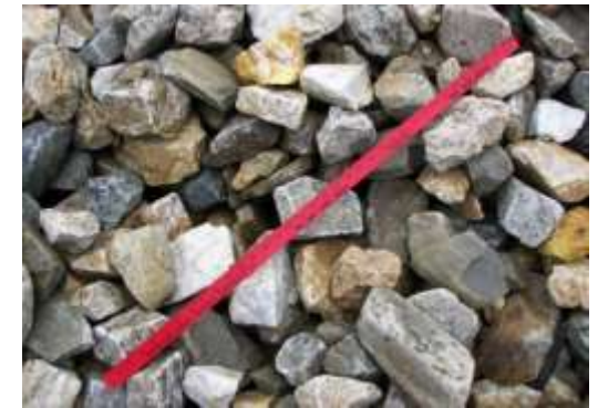
DLN: Ditch Liner, 6" to 3", also used as Decorative Landscape Rock.