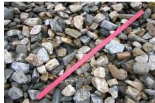
DSR: DEC Spec- Deep Trench Sewer Rock, 3" to 1-1/2" rock, also used as Decorative Landscape Rock.