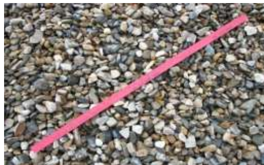
SSR: DEC Spec- Shallow Trench Sewer Rock, 1-1/2" to 3/4", also used as Decorative Landscape Rock.