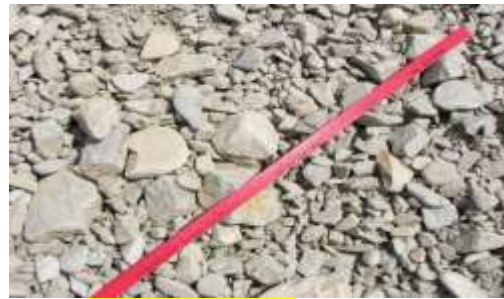
6MT: 6" Minus Tailings – a great base material w/o huge rocks, making thin fill lifts easier. Good on muddy base.