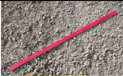
FRT: Fine Road Topping – 3/4" minus Gravel & Sand. This stuff packs tight! Tested @ 2% - 4% minus 200 mesh.