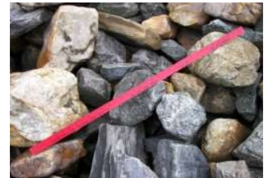
RRP: 6" plus Rip Rap, also used as Decorative Landscape Rock.