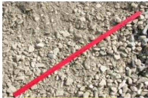
CRT: 2" Minus Coarse Road Mix. Combining 2" rock with FRT (50/50) gives a great packing road topping mix with more rock to hold up to traffic & water better.